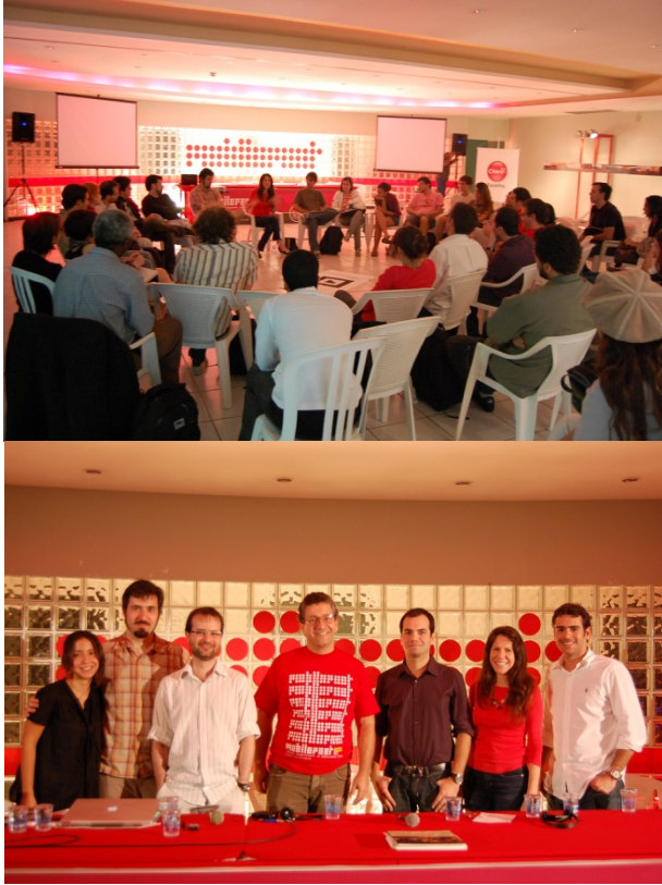
MOBILEFEST Rio 2010 Seminar, held at PUC-Rio, May 2010

For additional information: www.mobilefest.com.br