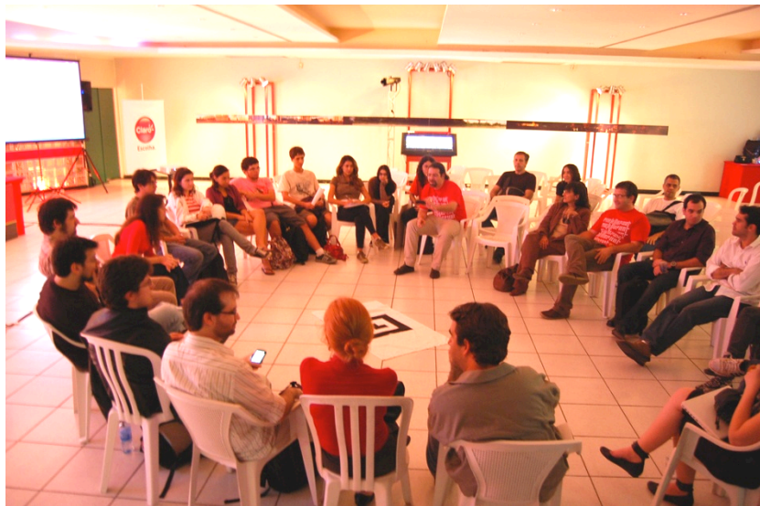
MOBILEFEST Rio 2010 Final Session, in which I had the opportunity to encourage speakers and participants to join, get involved and submit their works to SIGGRAPH conferences.