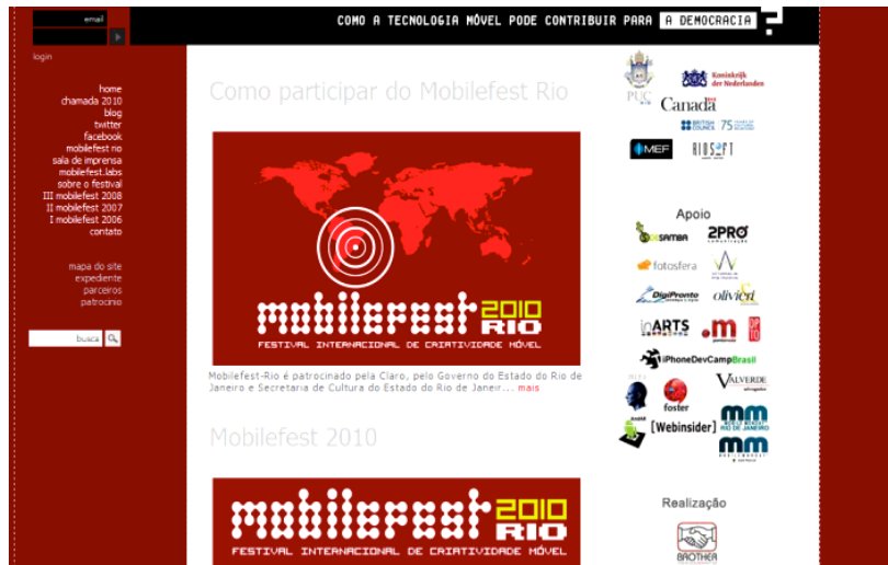
MOBILEFEST Rio 2010 site ( http://www.mobilefestrio.com.br/ )

speakers and attendees to join and attend SIGGRAPH conferences and its related events.